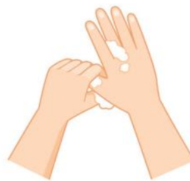
Bese of thumbs