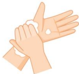
Rotationally rub wrists