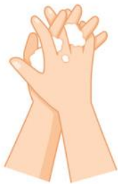
Palm to palm fingers interlaced