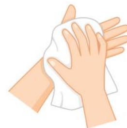
Dry hands thoroughly with towel