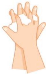
Back of hands