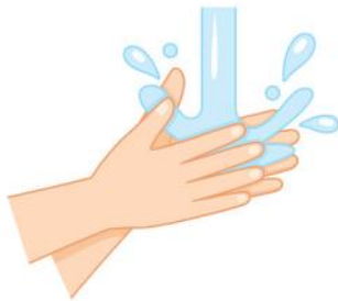
Wet hands with water