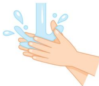
Rinse hands with water