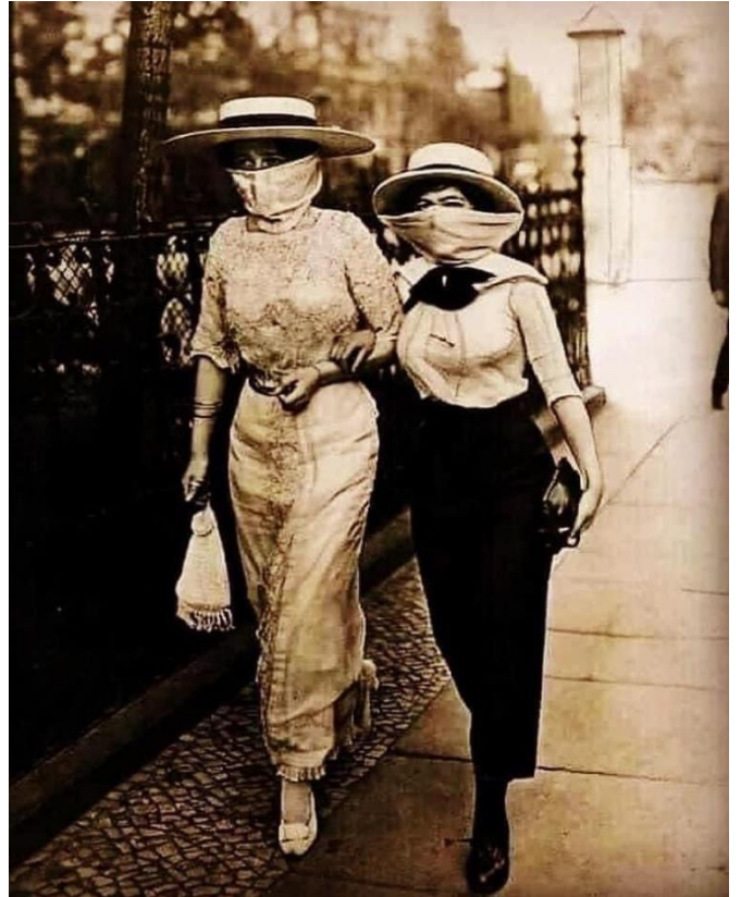
Photo taken during Spanish flu

And people stayed at home And read books And listened And they rested And did exercises And made art and played And learned new ways of being And stopped and listened More deeply Someone meditated, someone prayed Someone met their shadow And people began to think differently And people healed. And in the absence of people who Lived in ignorant ways Dangerous, meaningless and heartless, The earth also began to heal And when the danger ended and People found themselves They grieved for the dead And made new choices And dreamed of new visions And created new ways of living And completely healed the earth Just as they were healed.