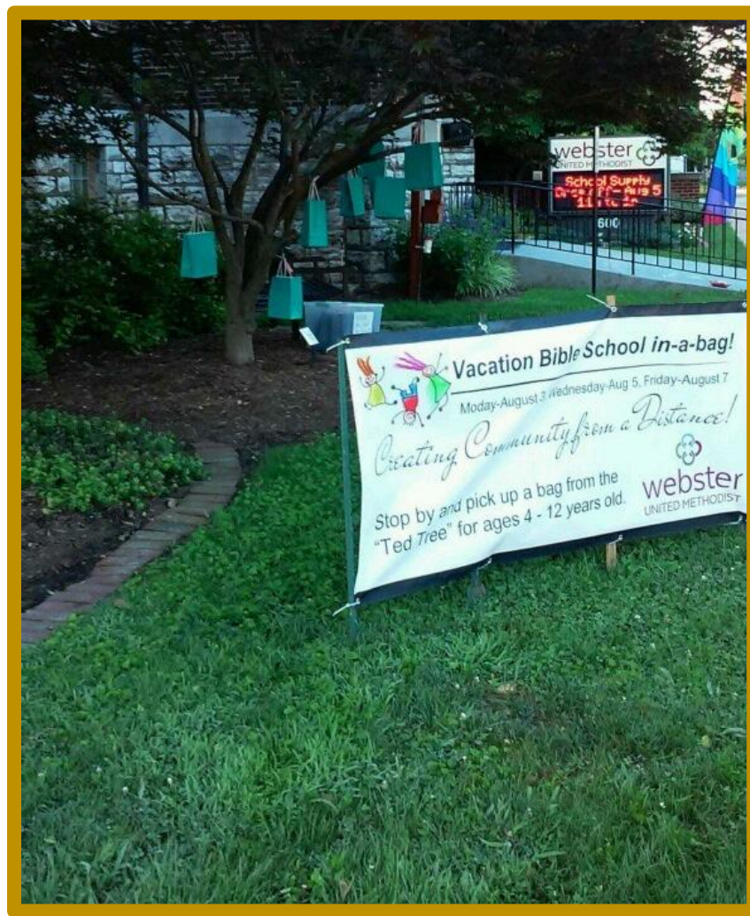
VBS in a Bag!