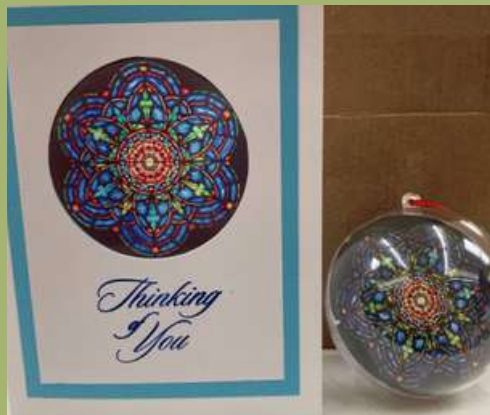
Greeting Cards & Ornaments featuring the Sanctuary Rose Window