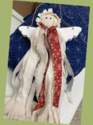
Angel Door Hangings