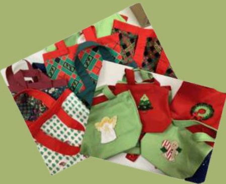
Cloth Gift Bags