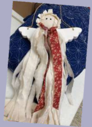
Angel Door Hangings