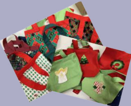
Cloth Gift Bags