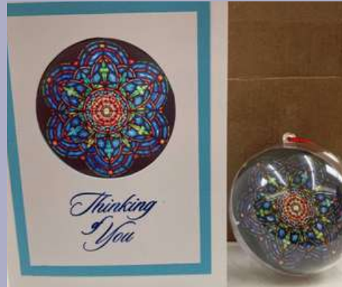
Greeting Cards & Ornaments featuring the Sanctuary Rose Window