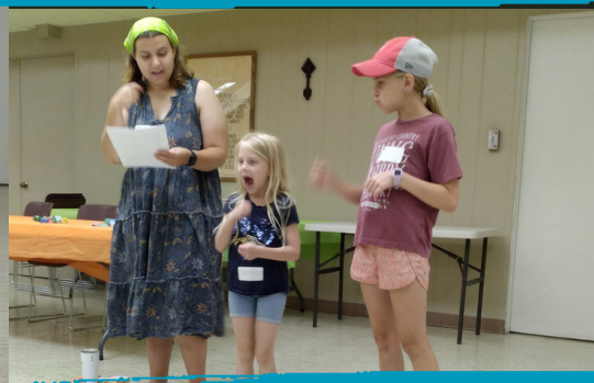
Acting out Bible Stories