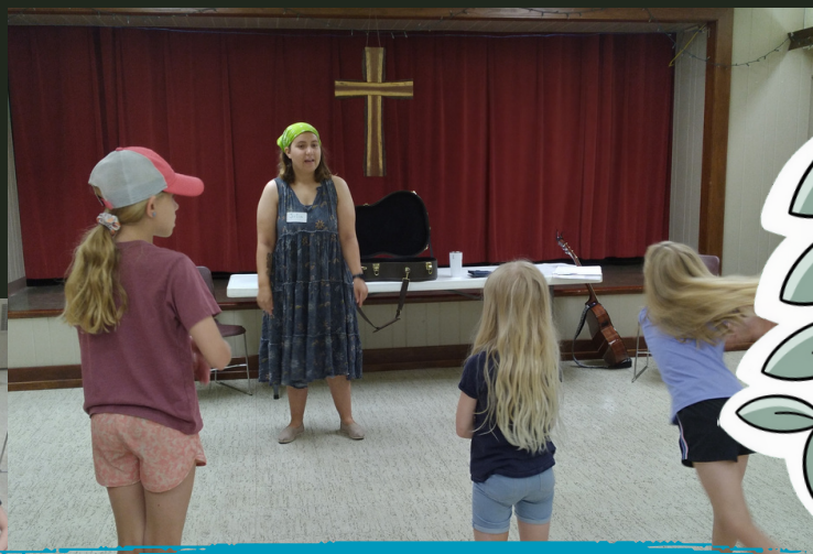
Swinging To The Music & Learning about Jesus