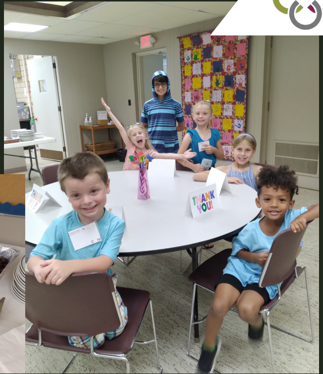
Table Is Set! Ready to serve Lunch To the Church Neighbors!

A Big Thanks to All Who Helped with Vacation Bible School!